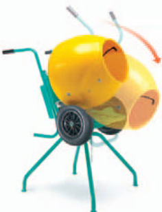
Optional WHEELMAN stand shown here.